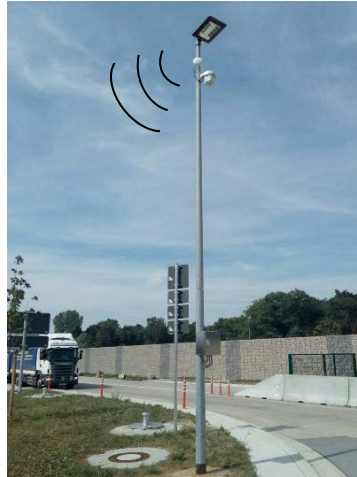
Figure: One of three access points per installation

Using existing infrastructure (including the fibre optic cable transmission route along the A9 motorway and the light poles on the parking area), a total of 8 motorway stations were equipped with WLAN internet access. The speed provided (bandwidth) should be at least 50 Mbit/s per motorway station. In parallel, the project was accompanied scientifically.